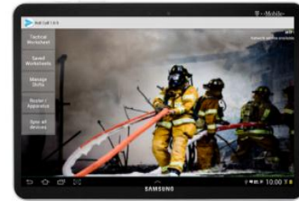
Windows 8 and Android 10.1 tablets

At the fire scene the Incident Commander can assign firefighters to locations perform auditable PAR checks and receive live updates of firefighter locations from other devices.